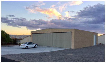
The Colburns' hangar is now complete, including the stucco; it's another very nice addition to the Airpark.